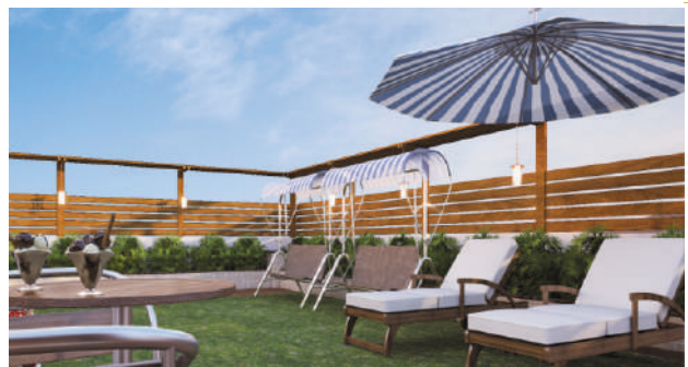
A garden is a friend you can visit any time