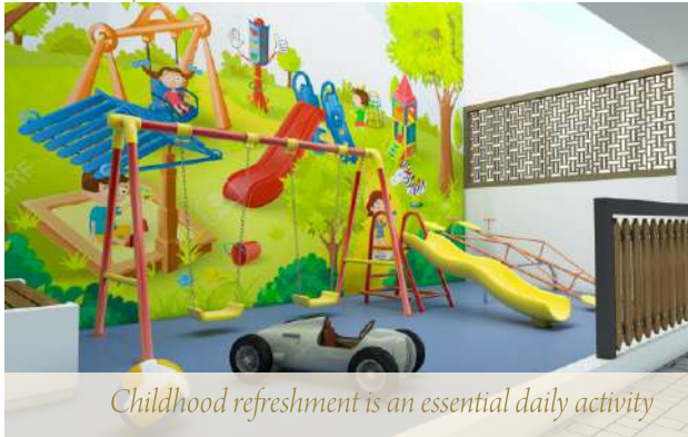
Childhood refreshment is an essential daily activity