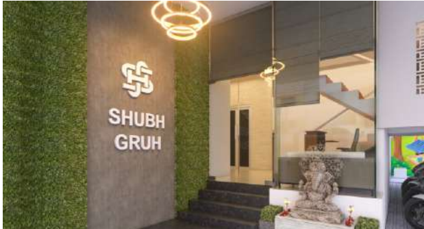
Let's talk SHUBH with the Life