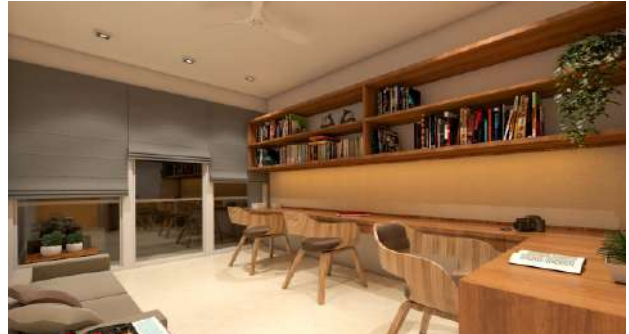
Peace of Mind increases intellectual level