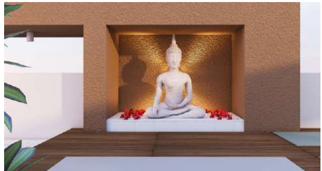
Boost your Soul with Positive Energy