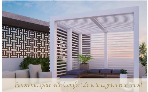
Panoramic space with Comfort Zone to Lighten your mood