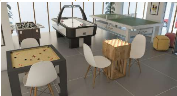
Refresh your tired evening, An option of club house